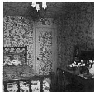
Chloe Sevigny's Apartment, Two Ways