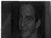
Israel: Arrested US-born Israeli Not a Spy