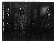
CBS News GOP town hall on the economy