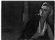
Winslet Poses For Sexy New Ad