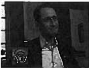
Weiner's leave of absence approved by House